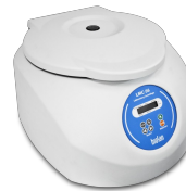
LMC-56 Without rotor Laboratory Centrifuge