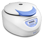
LMC-3000 Without rotor Laboratory Centrifuge

LMC-3000 is a modern low-speed bench-top centrifuge designed for operation with microtest plates and centrifuge tubes up to 50 ml. This device is widely used in biomedical profile laboratories.