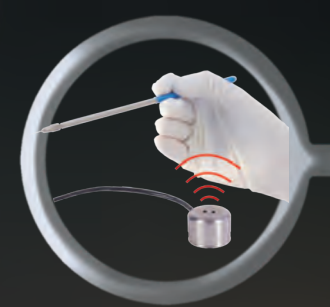
External DoubleClick IR-Sensor touch-free flame activation, made of stainless steel, cable length 0.4 m