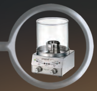
Spray protector for more safety when handling with pathogenic material

flame under conditions of strong air flow