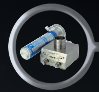
Safety adapter with integrated pressure regulator for gas cartridges CV 360 for gas cartridges Express 444

double lengh for better heating of Erlenmeyer flasks, decomposable and autoclavable